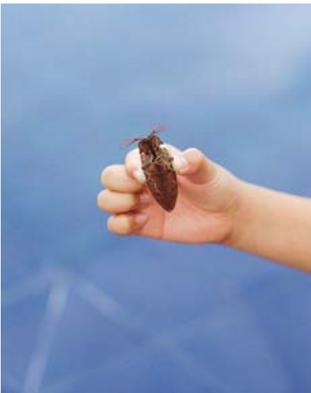
BEAU GOMEZ, FREAK BY NATURE