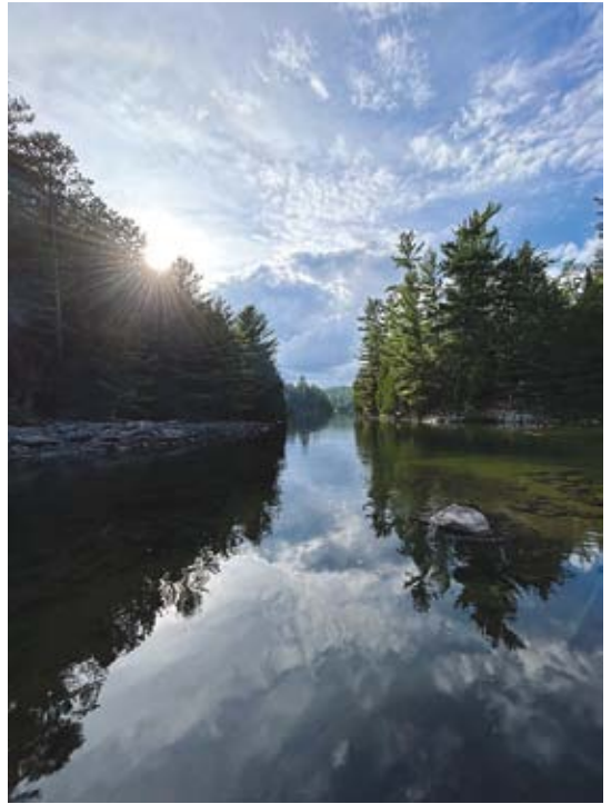
Pearl Van Geest at Red Head Gallery (to June 15)