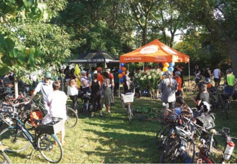
Cyclists participate in Cycle Toronto's annual fundraising ride The Big Toronto Bike Ride (see Tenant Profile on page 4).