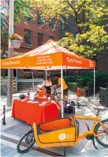
Above Cycle Toronto's Meet & Greet Station at 401 Richmond during Doors Open 2023.