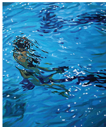
Heather Horton at Abbozzo Gallery (March 7 – 28)

Featuring students from Elementary and Secondary schools across the GTA