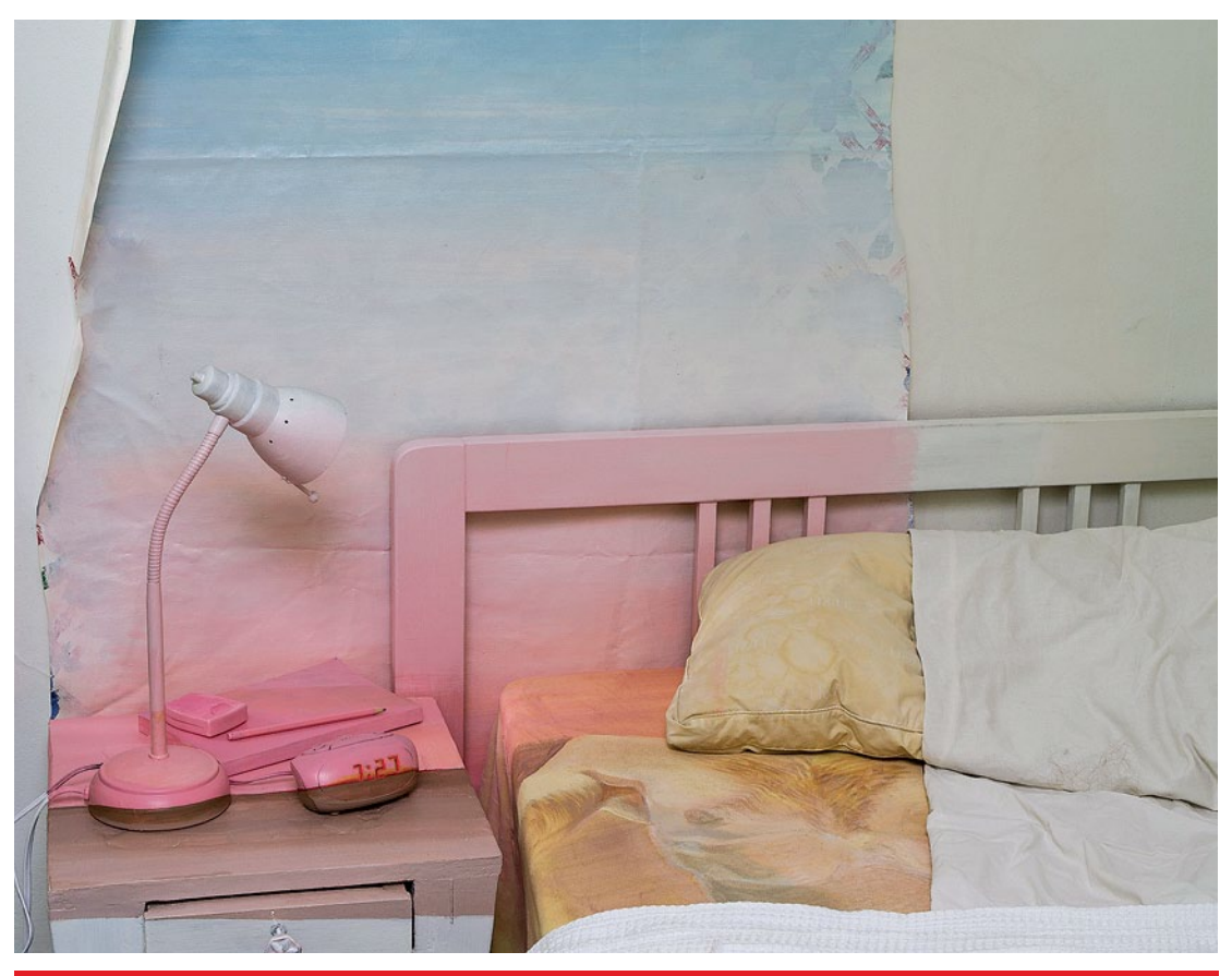
Top to bottom: Rachel Granofsky at Gallery 44 (June 5 – July 4); Heather MacArthur Bell at Urbanspace Gallery (to July 25)