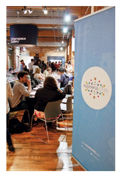
YOUTHFUL CITIES SUMMIT April 27 to 30, 2015

EASTER ART HUNT, LAST WEDNESDAYS March 25, 2015