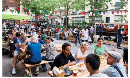
SPARTY June 18, 2015