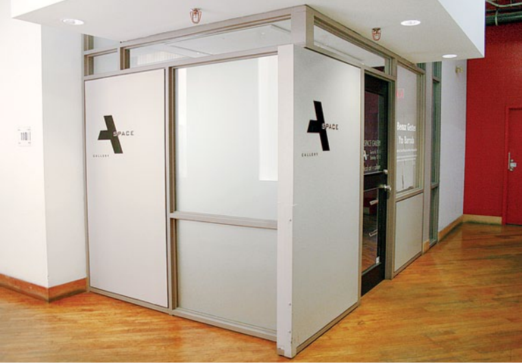
A Space Gallery celebrates 20 years at 401 Richmond